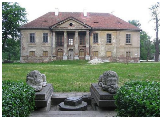
Fig.5. Palace in Pławowice vil. Current state.