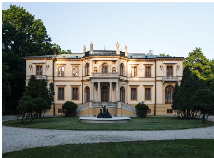
Fig. 13. Palace in Chelenow. Park facade. Current state. Source: [28]

Currently the palace and park complex belongs to botanic institute of unique plant cultivation.