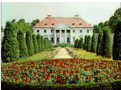
Fig. 11. Palace in Białaczów Front facade. XX century. Source: [27]