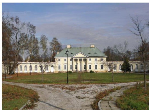
Fig. 12. Palace in Białaczów Front facade. Current state.

Palace in Chelenow – a small one-storeyed classicistic house with two wings from the both sides, which in the early XIX century (in 1807) was built by Tomasz Ostrogski – the head of senate of the Duchy of Warsaw and the Kingdom of Poland under the project of Jakub Kubicki. The palace complex is located in picturesque area surrounded by natural lakes and a big park.