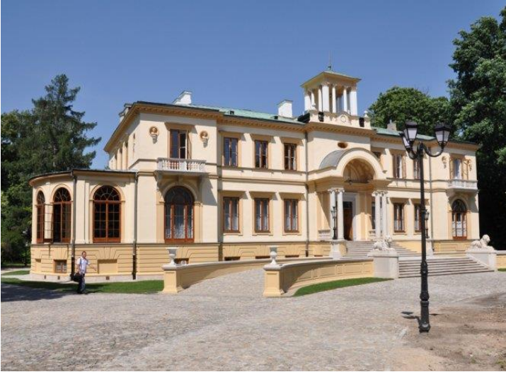
Fig. 14. Palace in Chelenow. Front facade. Current state. Source: [28]