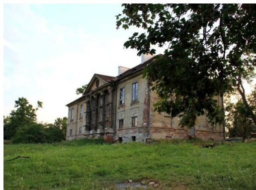
Fig.6. Pławowice vil. Current state. Source: [24]