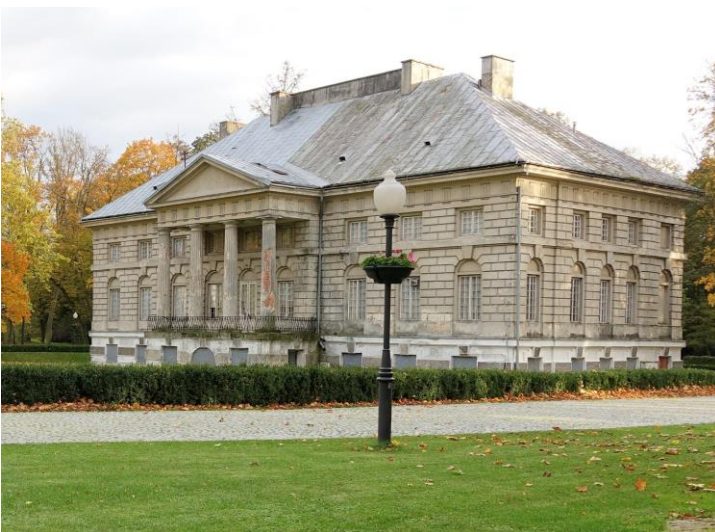
Fig. 16. Palace in Młochów. Territory of the palace and park complex. Current state. Source: [29]