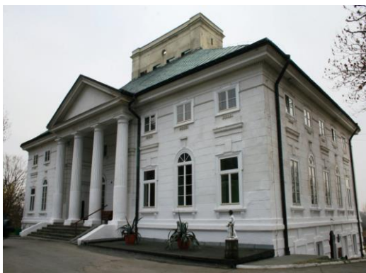
Fig. 9. Palace in Bejsce. Front facade. Current state. add in all illustrations. Source: [26]

In the palace there is "The House of secure retirement". Its management and the pensioners themselves take care of the object. It is planned to further construct the left wing, in accordance with initial project of Jakub Kubicki, as well as to generally repair gate pavilions.