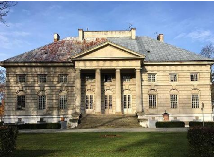
Fig. 15. Palace in Młochów. Front facade. Current state.