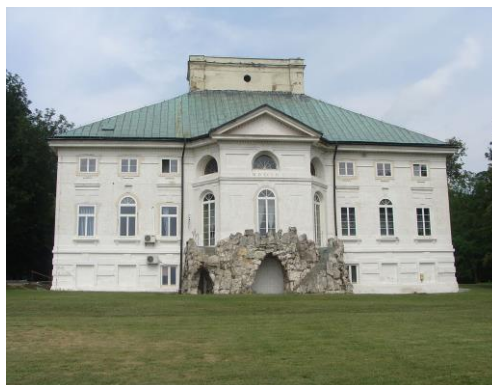
Fig. 10. Palace in Bejsce. Park facade. Current state. Source: [26]