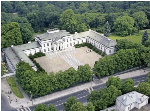
Fig.3. Belweder Palace. Top view. Current state.