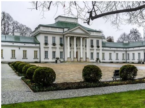
Fig.4. Belweder Palace. Front facade. Current state.

Palace in Pławowice village was constructed in 1804-1805 for Ludovic Felicjan Morstin, according to plans of Jakub Kubicki. For today it is the most precious and the greatest example of neoclassical manor architecture in non-urban area all over the country. The palace is located in a big park with a pond. One could enter the palace through the gates with statues of two lions (the sculptures are currently located in Krakow at the entrance to a town hall, on the gates there are installed their copies). The palace was owned by Morstin's family up to 1945. In 1945 the palace and park were ruined.