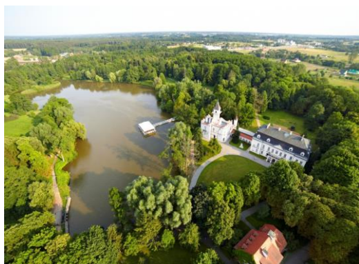
Fig.7. Palace and park complex in Radziejowice. Top view. Current state.