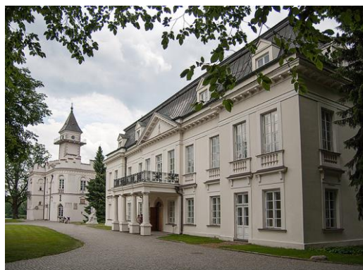
Fig. 8 Palace and park complex in Radziejowice. Territory of the palace and park complex. Current state.

The palace is one-storeyed, rectangular in plan, main entrance was emphasized with four-column portico and park entrance – with risalit. By using available terrain slope, the architect projected romantic cavern under the risalit.