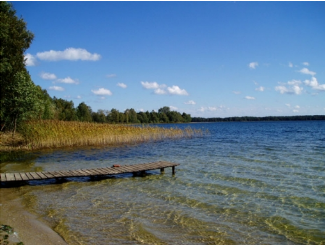
Fig. 1b. Shatsky National Natural Park: on its territory there are more than thirty lakes of varying sizes. Their total area is almost 70 square kilometers. They constitute one of the biggest European groupings of lakes. Source: [5]

Transport infrastructure also affects the urbanization processes, creating the frame of urbanization. The absence of a direct link between agglomeration Drohobych – Truskavets – Boryslav with Sambir is explained by natural factors.