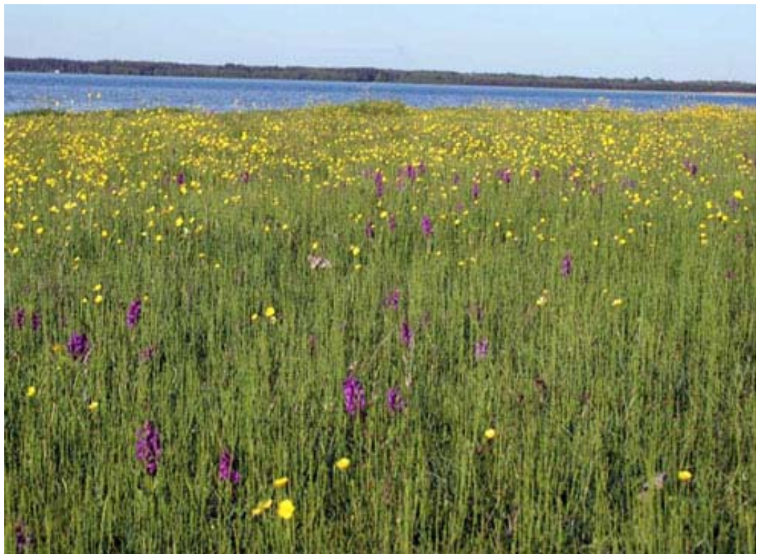
Fig. 1a. Shatsky National Natural Park: on its territory there are more than thirty lakes of varying sizes. Their total area is almost 70 square kilometers. They constitute one of the biggest European groupings of lakes. Ryc. 1a. Szacki Park Narodowy.