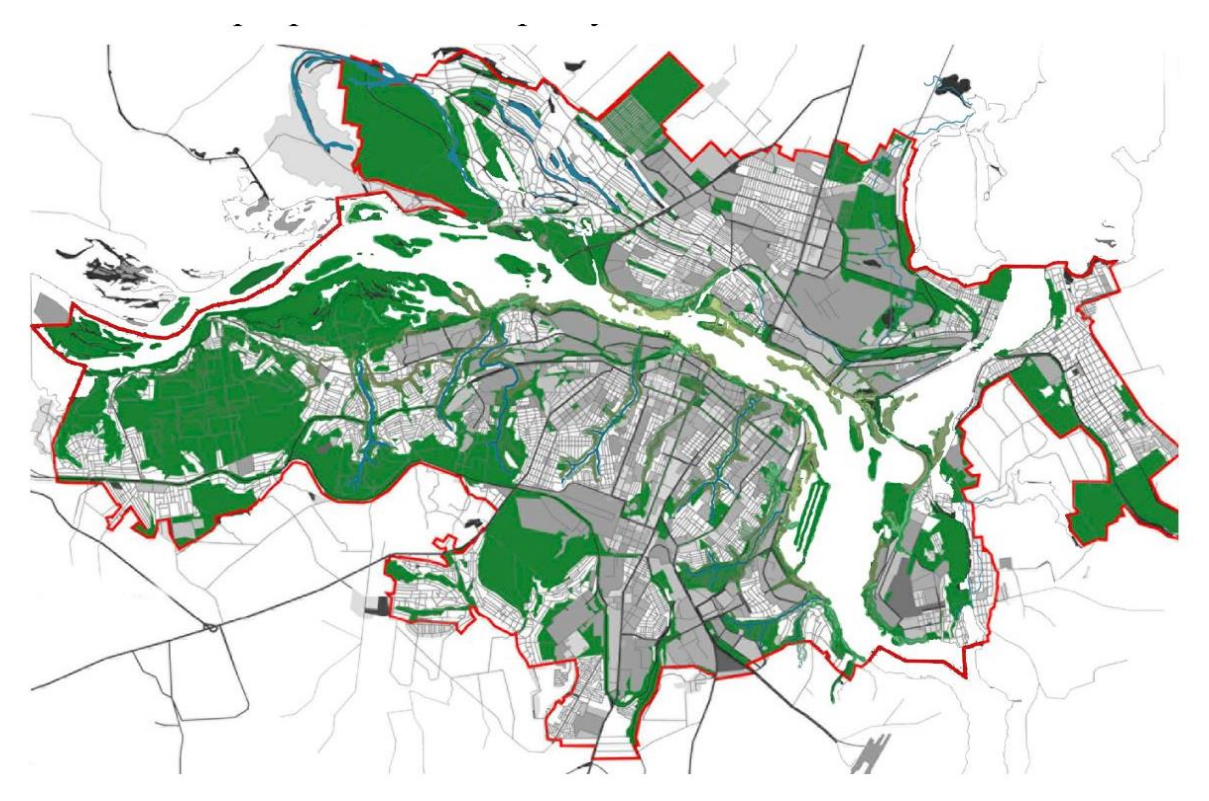
Fig. 1. Identity of recreational frame of the city .

The methodology of spatial-functional formation of the urban environment in the water area takes into account the transformation of the coastal zone into a spatial-thematic scenario together with the need to integrate the entire number of local urban planning tasks. Analysis of possible vectors of river space development within the city with the formation of a contact zone in its structure, as a tool for project modeling, makes it possible to regulate the structural components of buildings and landscaping within the water area, creating a contact area with meaningful levels of interaction of river areas (Bilokon Yu., 2003, p. 54).