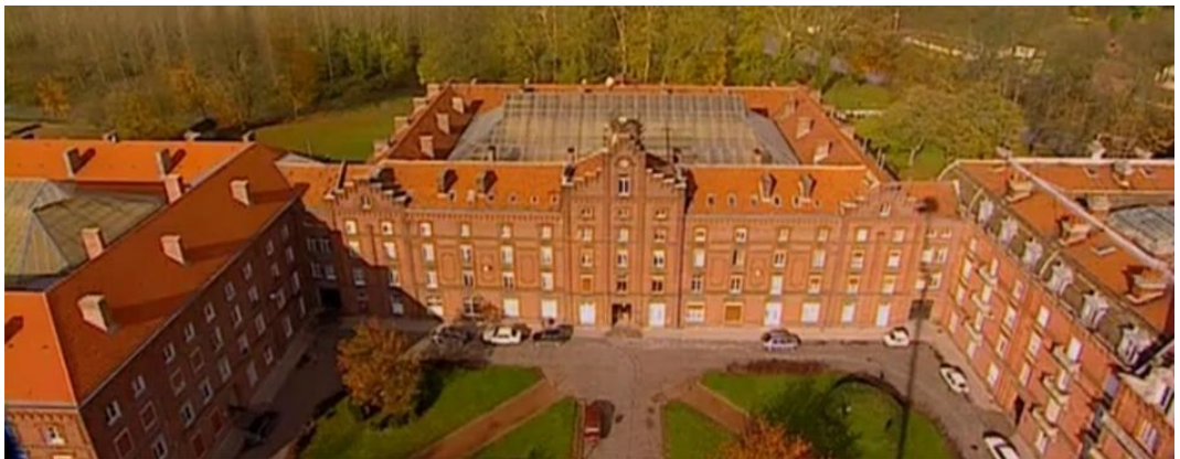
Fig. 4. The Phalanstère in Guise, by Jean Baptiste Godin.