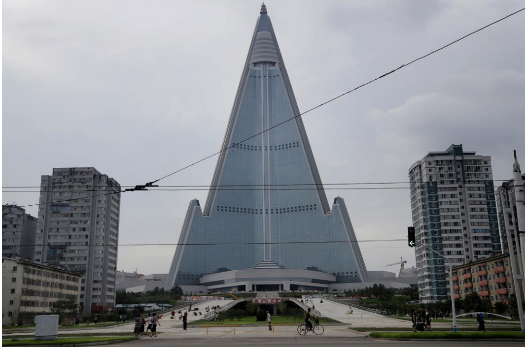
Fig. 3. The Ryugyong Hotel in Pyongyang, North Korea.