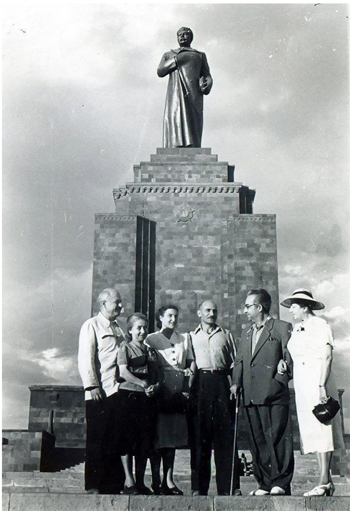
Fig. 1. Monument to Joseph Stalin in Yerevan.