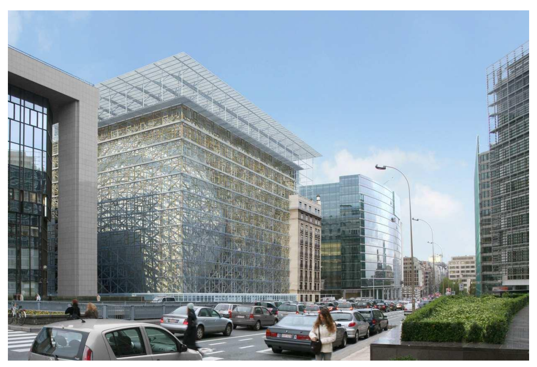
Fig. 4. Residence palace, Brussels. Architects: Samyn & Partners, Studio Valle Progettazioni and Buro Happold.