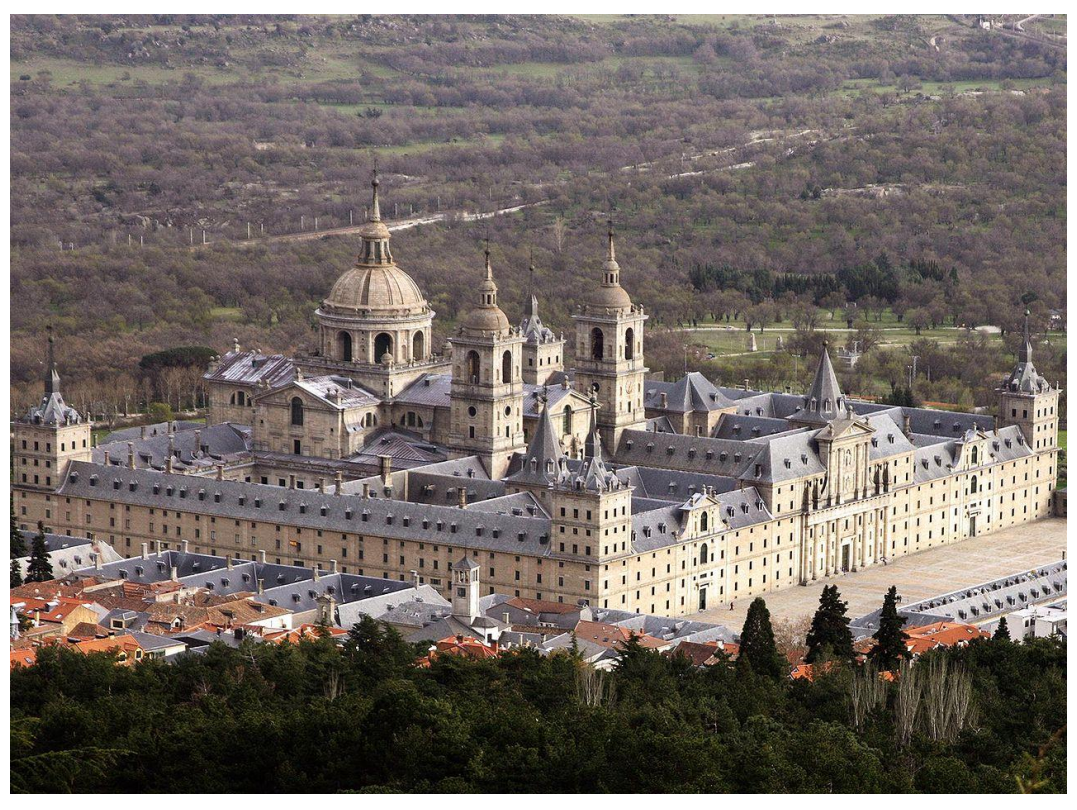
Fig. 2. Monastery of San Lorenzo de El Escorial. Architects: Juan de Herrera.