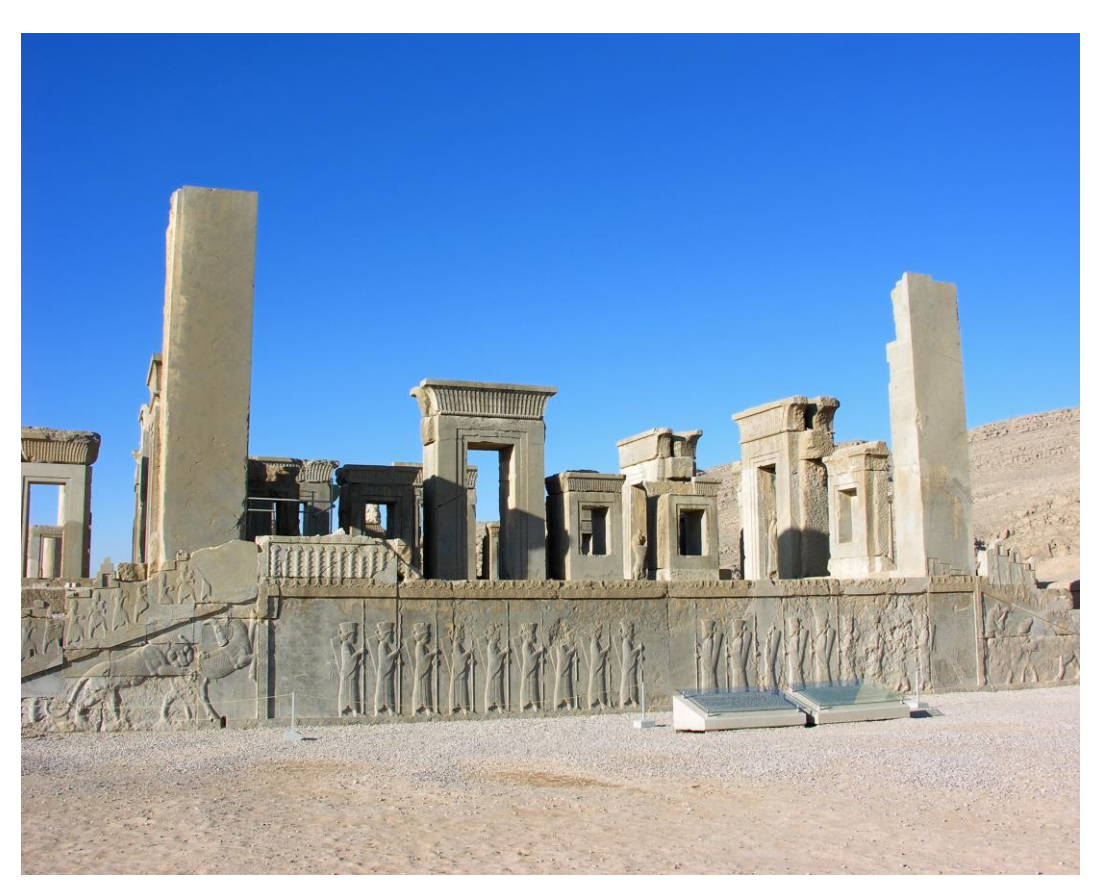
Fig. 1. Apadana, Persepolis.