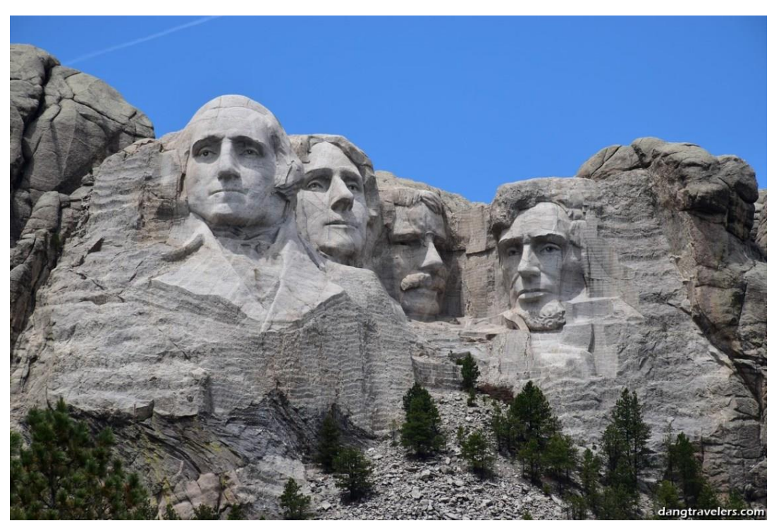
Fig. 8. Mount Rushmore National Memorial.