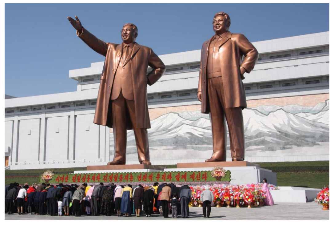
Fig. 3. Monument to Kim II Sung and Kim Jong II.