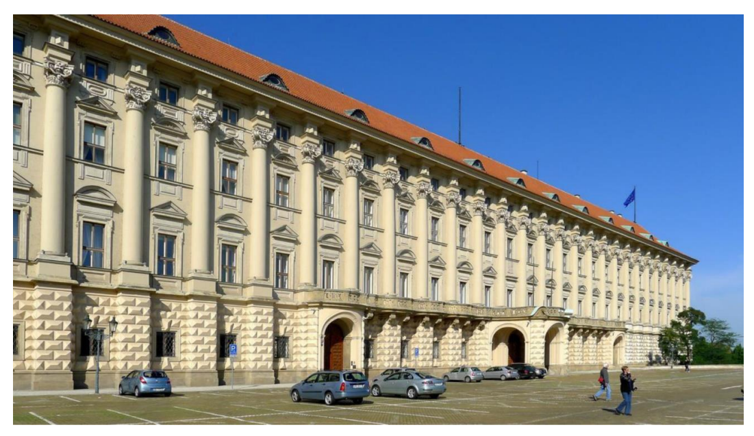
Fig. 5. Czernin Palace, Prague, Czechoslovakia. Architects: Francesco Caratti.