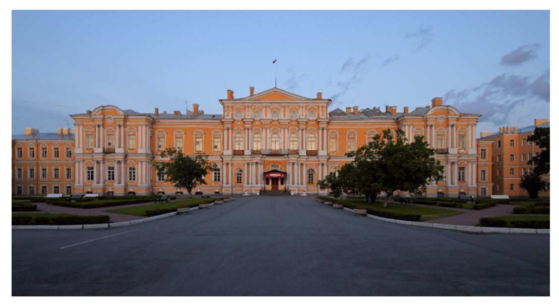
Fig. 6. Vorontsov Palace, St. Petersburg, Russia. Architects: Bartolomeo Francesco Rastrelli.