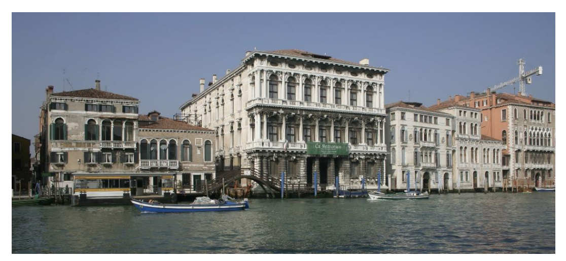
Fig. 7. Ca' Rezzonico, Venice, Italy. Architects: Baldassare Longhena.