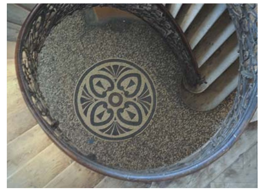
Fig. 28. Terrazzo floor with the central round element (5 Hryhorovycha Str.)

Two types of terrazzo floors have been spread: 1) made only from small chips; 2) combined from mosaic inserts and chips mixture. The second one was not so popular but it was more attractive and diverse (Dominican Monastery, 20 Lepkoho Str., 7 Ohijenka Str., 5 Hryhorovycha Str., 65 Doroshenka Str., 10-12 Levytskoho Str., 17 Krushelnytskoji Str., 3-5 Slovatskoho Str.). The appearance of mosaic on the floor obviously was connected with the ideas of the end of the 19<sup>th</sup> century, namely the objection of typical machine production and high evaluation of handwork (fig. 28, 30, 32).