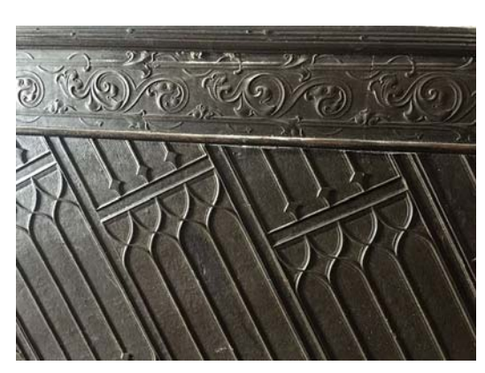
Fig. 26. Relief decoration of paneling (boiseries) of the staircase (5 Rylieieva Str.).