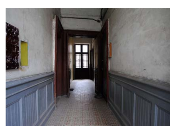
Fig. 24. Domination of wooden elements in interior space (33 Hmelnytskoho Str.).