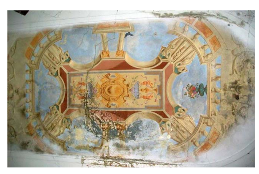
Fig. 15. Al secco mural of the upper store ceiling of the staircase in New Baroque Style (di sotto in sù technique - open sky, illusive architecture, trompe-l'oeil technique) in 16 Verbytskyj Str.