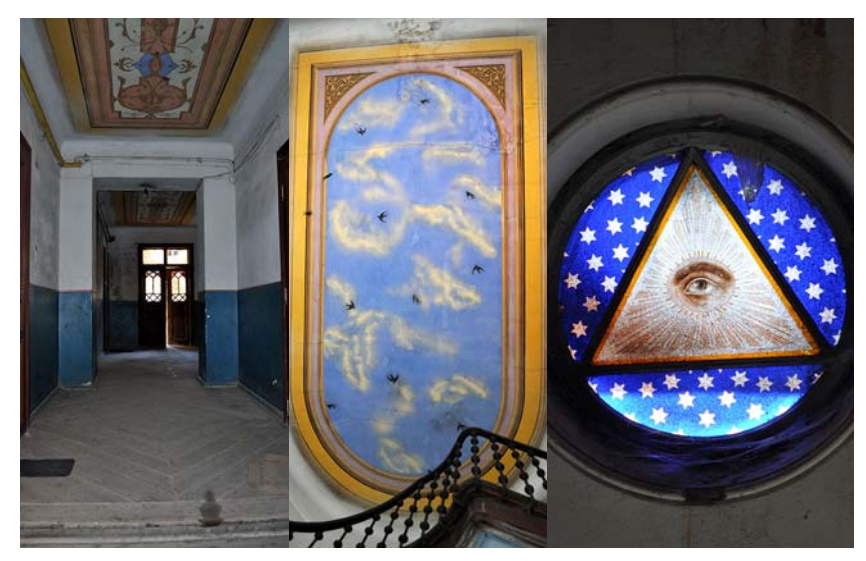
Fig. 43. Polychromy design of the interior space of the house in the Early Historicism Style: murals of the ceilings of the first and upper stories, stained glass of courtyard doors and windows, parquetry and wooden staircase (28 Chekhova Str).