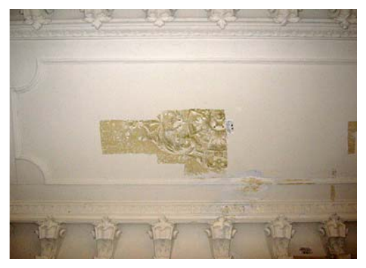
Fig. 4. The beginning of restoration of polychromy of vestibule with the sounding of grisaille rosette (school in Konyskoho Str.).

artistic polychromy). In Lviv the only one research work of architectural polychromy of the second half of the 19<sup>th</sup> century was done (school in Konyskoho Str.). According to the soundings all moldings were painted in delicate colors and in the center of the ceiling the grisaille illusive rosette was painted. The palette was very noble and delicate, consisting of shades of grey and ochre with orange (golden) accents. All these richness was replaced today with total white painting, which absolutely does not correspond with aesthetic views of the 19<sup>th</sup> century when white color was used only to emphasize certain details (fig. 4-6).