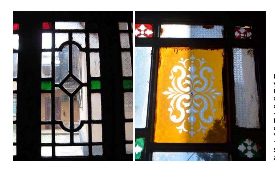
Fig. 19. Red, green, yellow and patterned stained glass of the courtyard doors and windows - magic transformation of interior and exterior space (16 Verbytskoho Str., 15 Hlibova Str.).

Nowadays a very small percent of stained glass of the 19<sup>th</sup> century in Lviv rental and residential houses preserved. Probably many artistic stained glass compositions are lost, however in each interior space of the period we found at least the small fragment of patterned glass, which reminds us about lost essential polychromy element creating a special soft and color lightening of interior space.