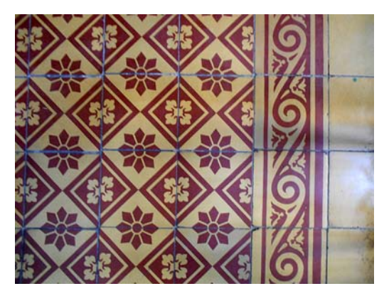
Fig. 35. Simple two-colored ornament of ceramic floor tiles was popular in interiors in the Historicism style (35 Levytskoho Str.)