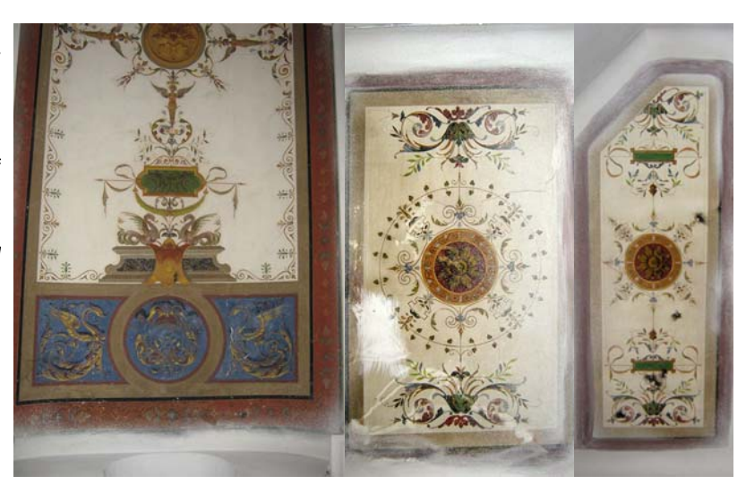
Fig. 10. Paintings of the ceilings of the pathway to the courtyard, of the staircase ceilings of all the stories (15 Hlibova Str.). New Renaissance Style: combination of light background with bright blue, red and green colors of small details and trompe-l'oeil technique).