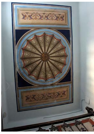
Fig. 7. Early Historicism buildings with al secco paintings in New Empire Style. The ceilings of the upper store of the staircase (Malaniuka Sq., 5 Levytskoho Str.).