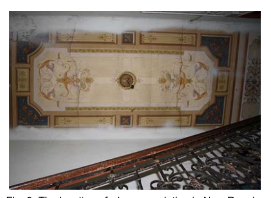
Fig. 9. The location of al secco painting in New Renaissance Style on the ceiling of the staircase (40 Franka Str.).