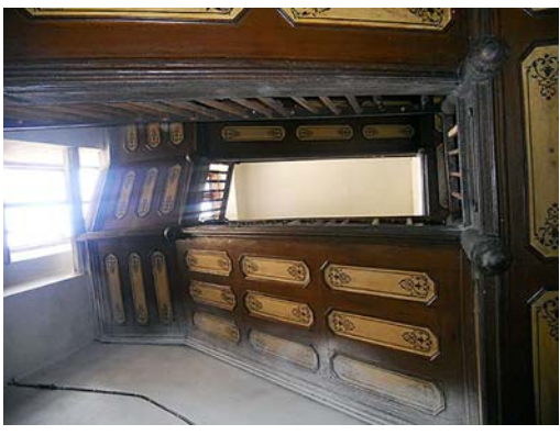
Fig. 25. Ornamental paintings of the wooden staircase (44 Doroshenka Str.).