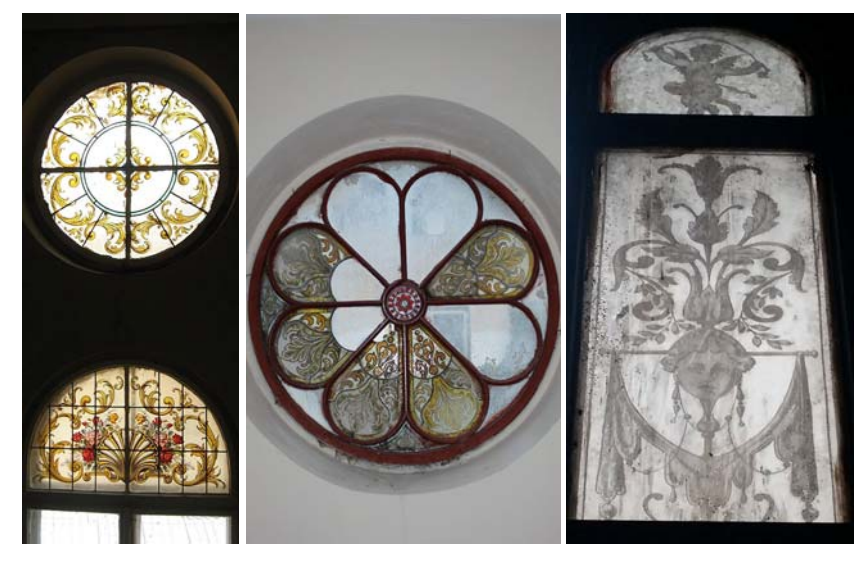
Fig. 20. Imitation of the stained glass in polychrome (23 Shevchenka Av., 43 Franka Str.) and monochrome versions (8 Shopena Str.).

In early Historicism, the floors were mostly covered with oak parquetry , which continued the general wooden theme of the Historicism interior (fig. 23-25). The whole staircase construction including balustrades, floors, ceilings, wall paneling ( boiseries ) was made from wood , which was varnished , painted in ochre palette with geometrical ornaments , or decorated with relief ornaments (fig. 25-26). Only few examples of such decoration preserved (33, 44 Doroshenka Str.). Besides wooden interior elements (especially the doors, panelling and balustrades) were decorated by graining (imitating of precious wood texture), as we can see in Opera theatre, Casino or few rental houses (fig. 27).