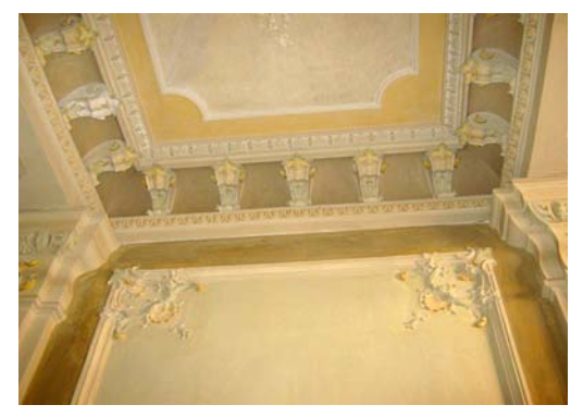
Fig. 6. The restored vestibule polychromy with delicate color palette of architectural decoration and grisaille rosette (school in Konyskoho Str.).

Therefore, we can suppose that all Lviv interior spaces have such architectural polychromy, often combining with murals located on the ceilings of the vestibules and staircases. Architectural polychromy is still waiting for its field research. However, murals, obviously due to their artistic value, were appreciated by inhabitants and preserved until today. Not all of them are in good state of preservation, most of them need qualified restoration, besides the murals are disappearing one by one, being one of the most unsteady polychromy methods, needing research and analysis. Therefore, we found more than 70 preserved paintings in interior spaces of Lviv residential buildings of the 19<sup>th</sup> – the first half of the 20<sup>th</sup> centuries. Among those paintings, there are merely 30 examples, which can be attributed to the 19<sup>th</sup> century. These unique paintings are characterized with precise copying of the methods and palette of historical styles in al secco technique.