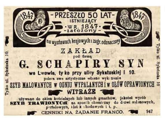
Fig. 40. Advertisement of stained glass and painted Fig. 41. Advertisement of monochrome imitation of stained glass manufacturing of the local firm "G. Shapiry stained glass manufacturing of the local firm "G. Syn" (Księga adresowa przemysłu galicyjskiego, 1901). Source: Leon Serge [22]

Rzędowski I., Sykstuska 18. Werner Arnold, Sobieskiege 3.