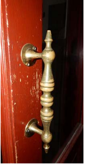
Fig. 38. Luminescent elements of the interior space of the rental houses of the 2<sup>nd</sup> half of the 19<sup>th</sup> century: mirrors, brass staircase details and latches) (7 Shopena Str., 5 Kyryla i Mefodija Str., 9 Dudaieva Str.