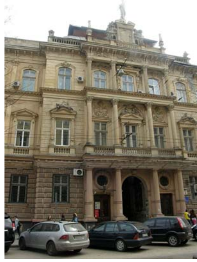
Fig. 1. The main law of façade polychromy of Historicism style is imitation (in colored plaster) of the color of natural stone surface (shadows of gray, ochre etc) – Kostiushka Str., Sichovyh Striltsiv Str.