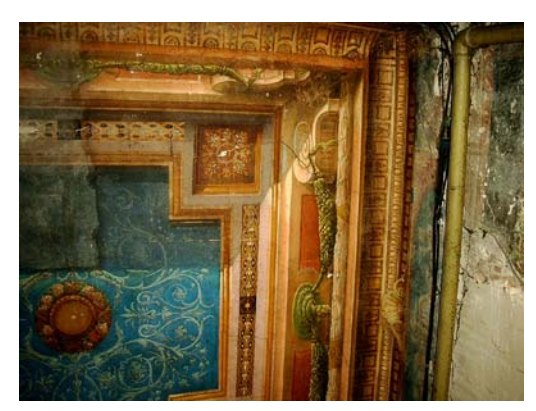
Fig. 14. Al secco painting in New Renaissance Style ( quadrature , turquoise background) on the ceiling of the staircase (9 Krakivska Str.).