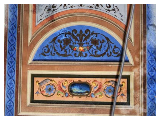
Fig. 13. Al secco murals in New Renaissance Style (arabesque, ultramarine background) on the ceiling of the staircase (4 Lysenka Str.).