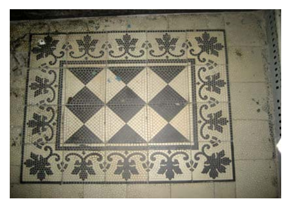
Fig. 33. Mosaic monochrome ceramic floor tiles of the Early Historicism period (19 Lychakivska Str.).

Moreover, the transition of medieval or renaissance motifs to ceramic floor tiles became the new step in their development, which totally changed the restrained polychromy style of the Historicism interior (fig. 37). Various contrast color combinations appeared, which correspond to lighter and brighter palette of the murals. Therefore, the late Historicism interior was brighter and more luminescent due to multicolored ceramic floor tiles and the use of metal fences instead of wooden parquetry and balustrade, which gave soft ochre color without shine. The general shining effect was enforced with the use of mirrors, brass and bronze staircase details, which gain the wide popularity etc. (fig. 38).