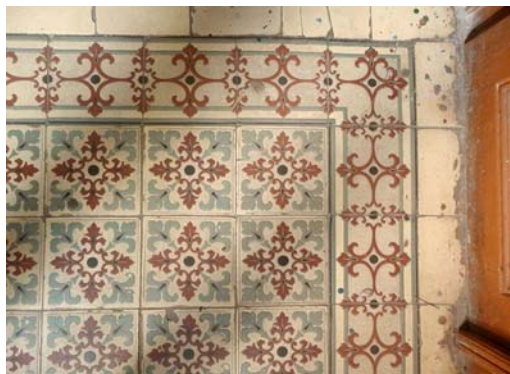
Fig. 34. Mosaic tricolor ceramic floor tiles of the Early Historicism period (44 Chuprunki Str.).