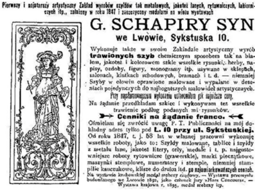
Shapiry Syn" (Księga adresowa przemysłu galicyjskiego, 1902).