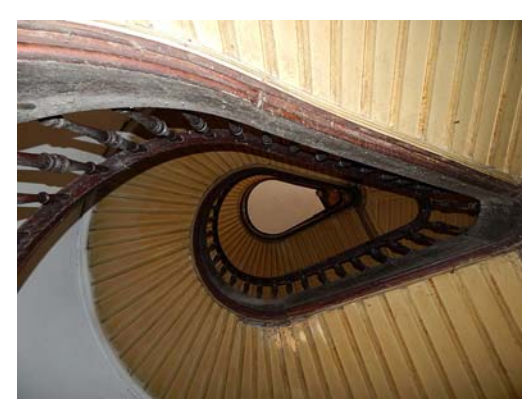
Fig. 23. Domination of wooden elements in interior space (19 Chajkovskoho Str.).