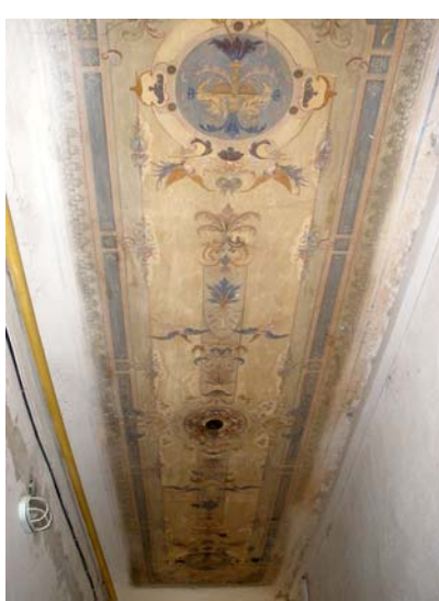
Fig. 44. Preserved elements of typical polychrome interior design of building in Historicism style: multicolored mural of the ceiling and tricolor terrazzo floor (7 Stavropihijska Str.).

As a rule, the general darkness of interior space of the building of the 19th century allowed using all polychromy techniques simultaneously. In Lviv Historicism interiors stained glass were combined with murals on plafonds and polychrome floors decorated with terrazzo and ceramic tiles. Because of the location of stained glass in the courtyard windows, they were not lightened well and therefore did not effect on the general polychrome scheme of the interior (fig. 43-44).