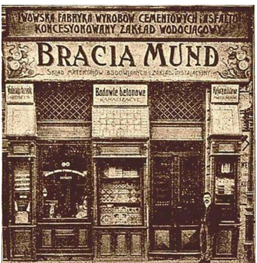
Fig. 2. The murals and inscriptions on the façade served for advertisement purposes – 37 Market Square, 23 Doroshenka Str.