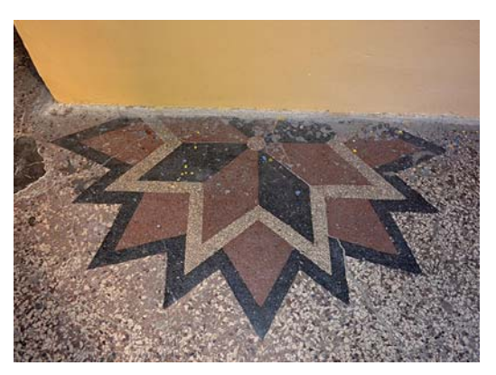
Fig. 31. The terrazzo floor with star ornament divided with later constructed wall.