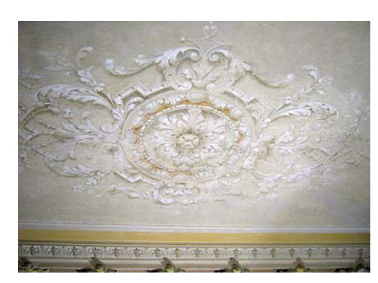
Fig. 5. The restored grisaille rosette (in Trompe-l'œil technique) on the vestibule ceiling (school in Konyskoho Str.).