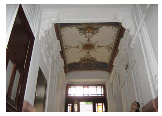
Fig. 8. The location of al secco painting in New Renaissance Style on the ceiling of the pathway to the courtyard (15 Hlibova Str).