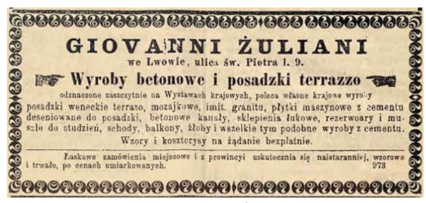
Fig. 39. Above: advertisement of terrazzo manufacturing by G. Żuliani firm in Lviv (Gazeta I wowska 1894, nr. 25). Source: Serge Leonov [22]. Below: advertisement of ceramic tiles facto-(Lviv address ries book, 1897). Source: Serge Leonov [22]