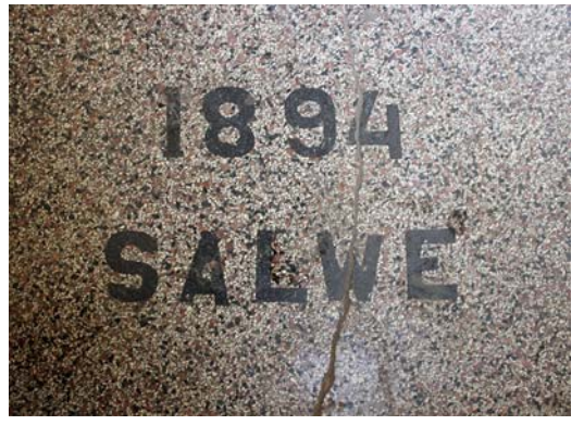
Fig. 29. Terrazzo floor with inscription of the erection of the building (40 Franka Str.).