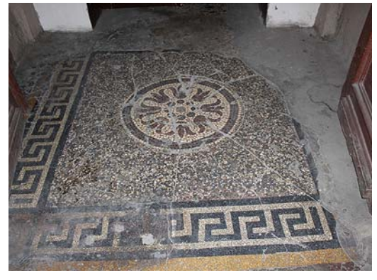
Fig. 30. The destruction of terrazzo floor in the vestibule in 20 Lepkoho Str.