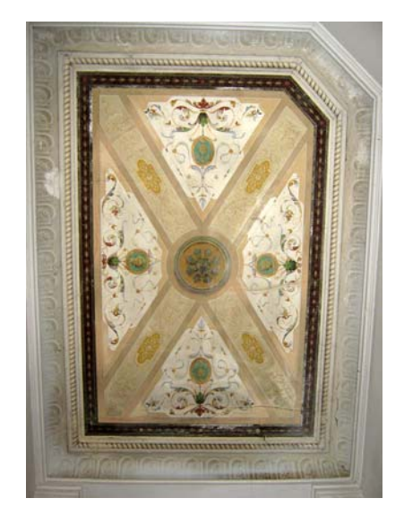
Fig. 11. Similar manner of al secco murals of the ceilings of the buildings on one street, obviously painted by the same author (15 Hlibova Str., 7 Hlibova Str).