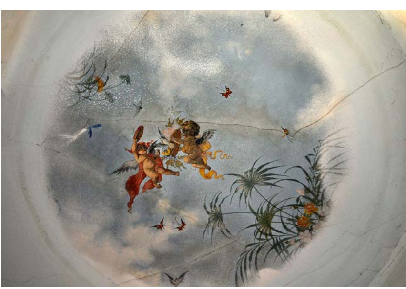
Fig. 16. Al secco mural of the upper store ceiling of the round staircase in New Baroque Style (di sotto in sù technique -open sky, floral elements, playing angels-putti) in 3 Chekhov Str.