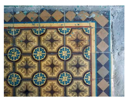
Fig. 36. More complicated ornament of ceramic floor tiles with illusionistic effect (40 Chuprunki Str.)