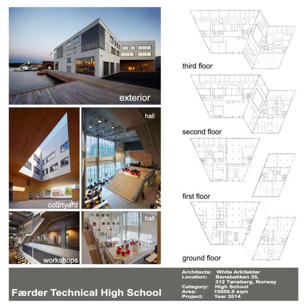
Fig.2. Færder Technical High School / White Arkitekter.

The three existing buildings have been integrated alongside other activities. The spatial plan is based on a vertical sequence. A main large multifunctional space functions as an entrance lobby, dining hall, auditorium and gallery; somewhere the entire school can gather under one roof. This was in stark contrast to before, where students were restricted to allocated, separate school buildings. Four levels of glazed workshops and rehearsal rooms sit adjacent to this core space. Instead of being hidden away in dark rooms, their activities are visible to the students inside, as well as the world outside [2,10].