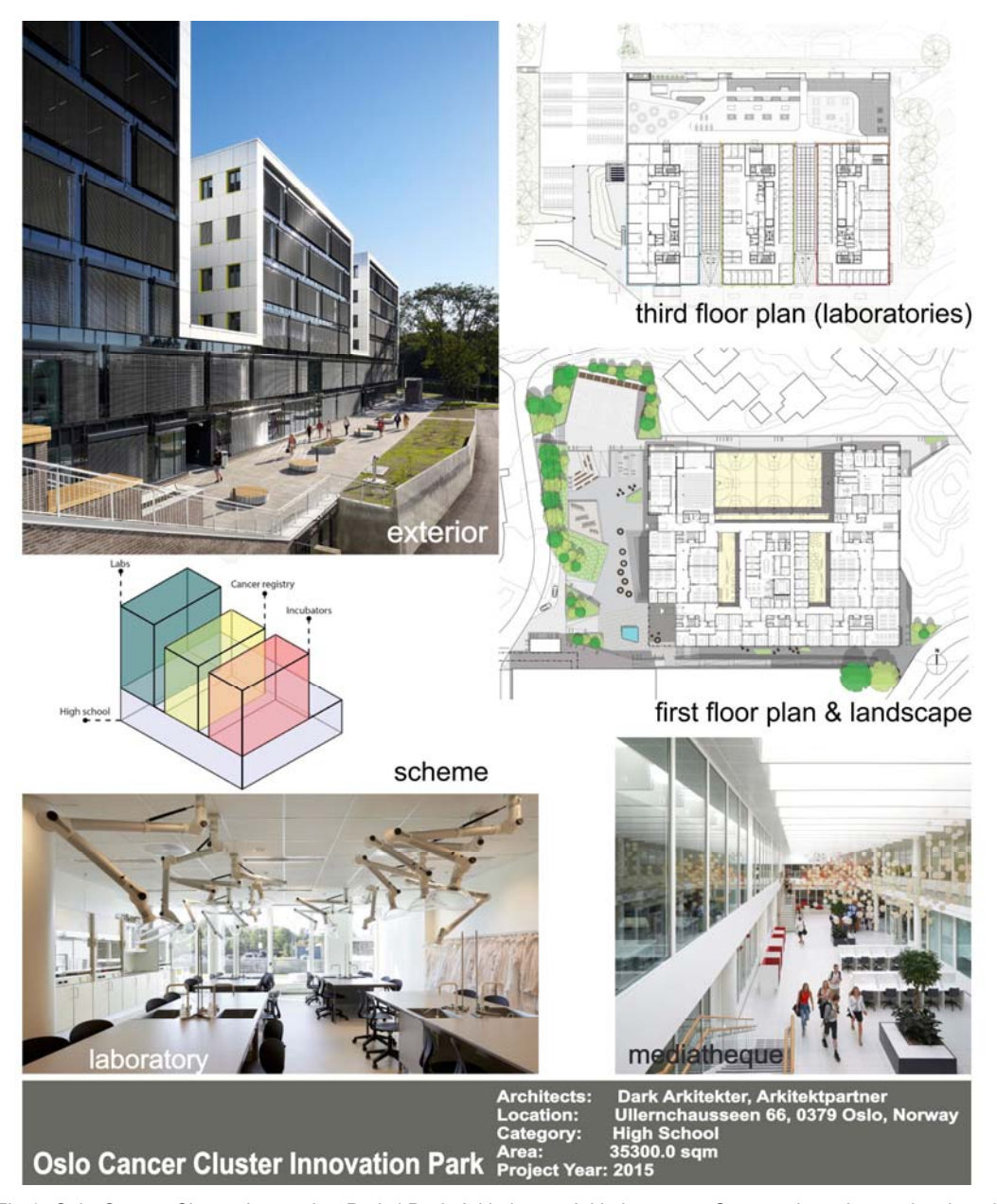
Fig.1. Oslo Cancer Cluster Innovation Park / Dark Arkitekter + Arkitektpartner.

Oslo Cancer Cluster designed by two Norway architectural burros Dark Arkitekter & Arkitektpartner is one of a bright example of cooperation of standard school function and premises with specialized rooms of the scientific profile. Dark and Arkitektpartner won the concept competition back in 2011 for Oslo Cancer Cluster Innovation park (OCCI), a building that opened its doors in the autumn of 2015 to the Norwegian Radium Hospital and the Institute for Cancer Research, as well as Ullern High School, a magnet school for students of biomedicine [7].