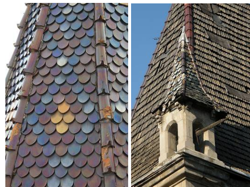
Fig. 20. Glazed plain roof tiles ('karpíówka') on Lviv towers (6 Samchuka Street, 50 Chuprynki Street).