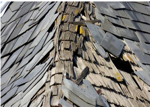
Fig. 17. The fragment of shingle coating of the roof of Franciscan church covered later with slate tiles.