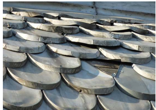
Fig. 22. The fragment of the Covering of the roof of Sacrament church with so-called 'moulding iron roof tiles'.