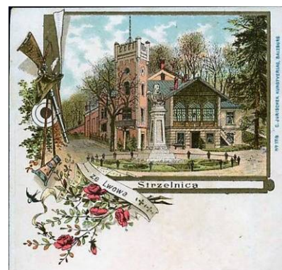
Fig. 2. Façade painting of the former city shooting range. Watercolour of the end of the nineteenth century. Source: [7]