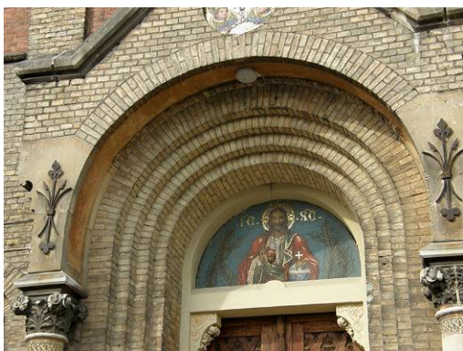
Fig. 9. Polychrome design of entrance of Franciscan Church.