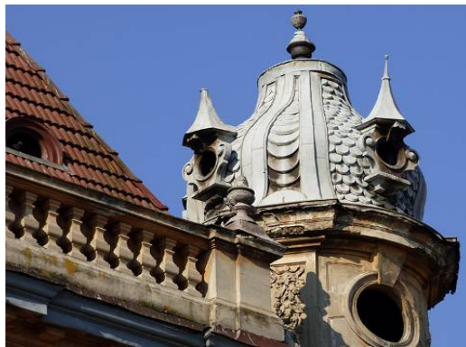
Fig. 21. Covering of the roof with so-called 'moulding iron roof tiles'. The tower of the building on Soborna Square.

Despite this diversity of techniques and materials, we can note that polychromy in the architecture of L`viv Historicism more actively have been developed in the interior. The interiors of public and sacred buildings in various historical styles demonstrated an outstanding polychrome diversity of techniques and materials according to their historical analogies: parquetry, ceiling and walls paintings, marble and wood wall coating, stained glass, wallpapers, brass and bronze details, Terrazzo, ceramic floor tiles, linoleum and more. This polychrome richness, especially in dwelling houses interiors [24], and its manufacturers require special consideration in the following publications by authors.