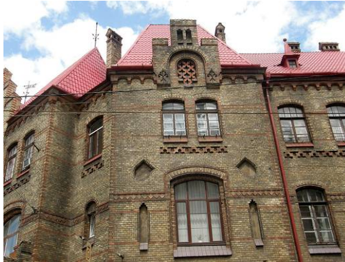
Fig. 12. Polychrome brick masonry contrasting with disharmonious color of modern roof.