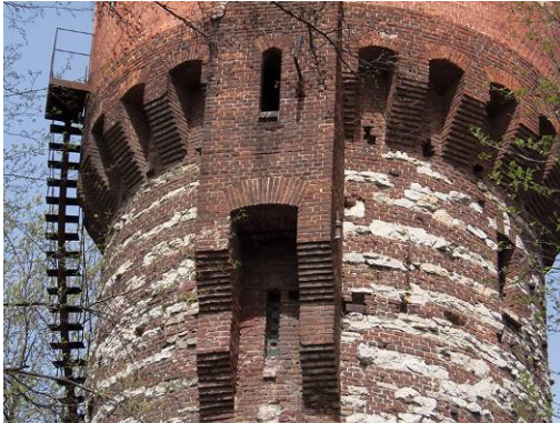
Fig. 11. Brick masonry in combination with stone inserts. Water Tower of the Regional Exhibition of 1894.

in particular for manufacturing of timber construction and decoration of exhibition hall in L'viv in 1892 and other buildings. Since 1896 real joinery workshop opened at the Levynskyi's factory, which also held teaching students, and in 1911 transformed into a real joinery factory [55].