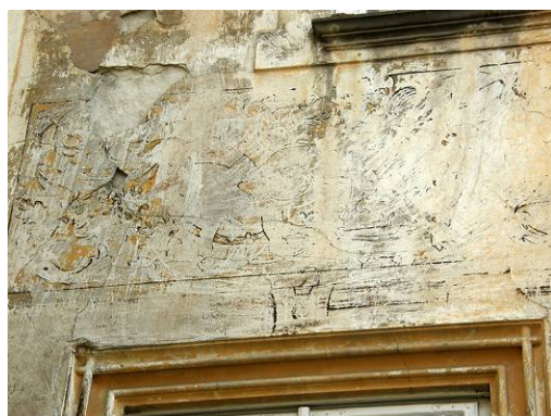
Fig. 5. Fragment of façade painting of Schulz brothers' mansion. Ochre background and black outline.