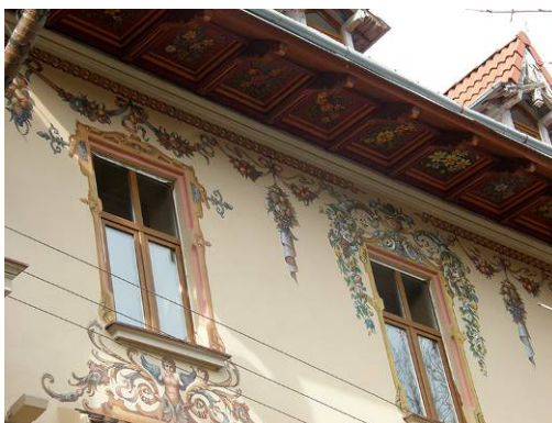
Fig. 8. Fragment of façade paintings of the façade of Chopen Hotel (after restoration by Yevhen Sobolevskyi, 2000s).