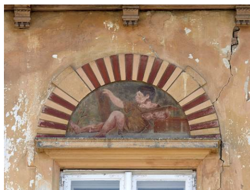
Fig. 6. Façade painting of Schulz brothers' mansion. Imitation of architectural decoration like Sgraffito.

At the beginning of 1880, the mosaics appeared on L`viv facades. We have no information about the use of this technique in earlier periods, while it appears in a picturesque tendency of historicism as a following of early Byzantine art. Similarly to their origin, mosaics decorated facades of L`viv sacral buildings. In addition, the conception of manual production opposed to machine production was typical for the second half of the 19th century and influenced upon the spreading of mosaics. Luxury however small mosaic composition decorate the facades of Franciscan Church (Lysenko Street) (Fig. 9-10) and the Church of St. George (Korolenko Street). The use of vivid open colours (red, blue, green, yellow) on a gold background according to medieval tradition characterized these works of art.