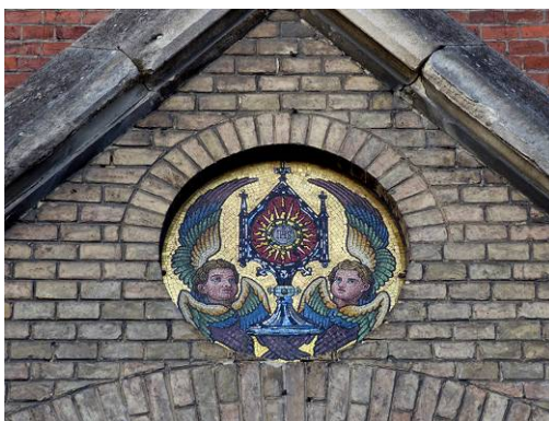
Fig. 10. Mosaic on the brick façade surface of Franciscan Church.

Another approach to the decorating of the facade in the second half of the nineteenth century was masonry with opened brick surface [27], plastic and colourful combination of which often became a main façade decoration. The first manifestation of this trend appeared in L'viv in 1850-s, in the architecture of so called Rundbogenstil , namely in the House and Chapel for war veterans (Kleparivska Street). Instead, this style was not widespread in L'viv, and a tendency to demonstrate opened brick surfaces revived in the late nineteenth century in combination with other beautiful finishing and building materials. In fact, architects Teodor Talowski and Napoleon Łuszczkiewicz used brick masonry in combination with stone incerts on the facades of the buildings (villas Yu. Wang, 'Przystań'). Traditionally the façades of industrial buildings were created in 'brick style', e.g. Water Tower located in Stryjski Park by Arnold Röhring (Fig. 11). To create a brick surface of the façade special facade brick was used (so called Ziegelrohbau , Verblender