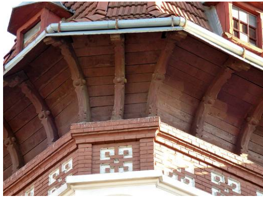
Fig. 16. Wooden brackets and cornice in combination with brick ornamental masonry of the building on 91 Bandery Street.