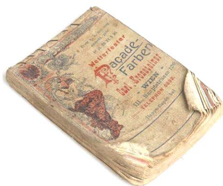
Fig. 3. Catalogue of facade paints of Carl Kronsteiner's factory (Facade-Farben Carl Kronsteiner Wien: brošura).

The richness of these paintings was covered with plaster for many years and appeared only during the restoration of the building (architect Yevhen Sobolievskiy, 2000s) (Fig. 8). Accordingly, we can assume the existence of paintings on the facades of other buildings in L`viv at the time, waiting to be discovered. In particular, because of plaster ruination on deaf windows of the house on 30 Samchuka Street we can observe the presence of paintings in New Baroque style - bouquets in vases of blue tones. The creative manner of the architect of this building Jakób Rysiak was characterized with the use of picturesque paintings both on the façades and on interiors.