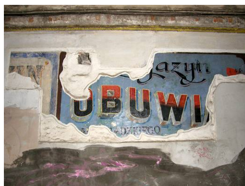
Fig. 4. Advertising painting with cobalt background on the wall of Andreoli passage.