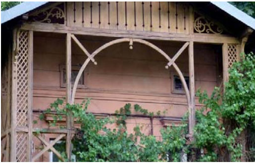
Fig. 15. Wooden veranda of the villa on Yaroslavenka Street (destroyed now).

decorated, including the Sacrament church (Fig. 21, 22). If in the 17th century roofing iron was painted in red, then in the late nineteenth century gray painting imitating natural slate color was spread.