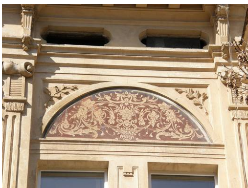
Fig. 7. Fragment of façade painting of the façade of 4 Parkova Street. Imitation of Sgraffito.