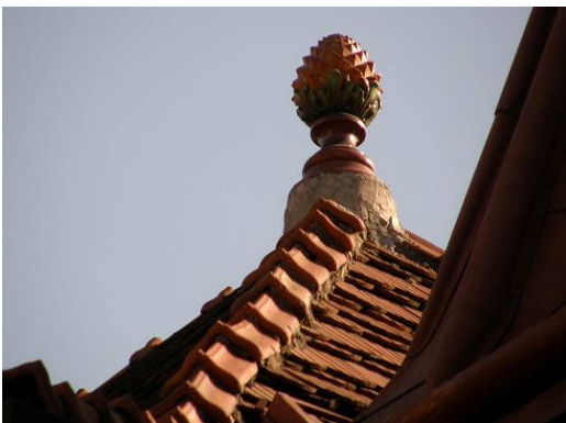
Fig. 19. Ceramic decorative elements on the roof of the building on 29 Kotlyarevskogo Street.