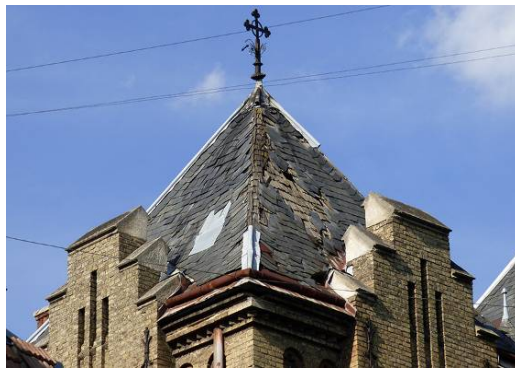
Fig. 18. Slate tiles on the roof of Franciscan church in combination with ochre brick walls.