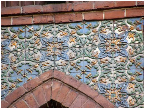
Fig. 13. Arabesques made from majolica tiles on the façade of Jan Styka's villa.