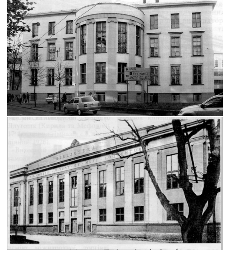
Fig. 2. Building of Research Library Lviv Polytechnic National University. The author professor V. Minkevych.