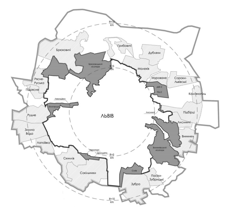
Fig. 10. Suburban area of Lviv according to Masterplan of year 2008. Territories, that are currently included to the city are indicated with darker colour Source (Petryshyn H., Sosnova N. 2017), graphics by author, 2018