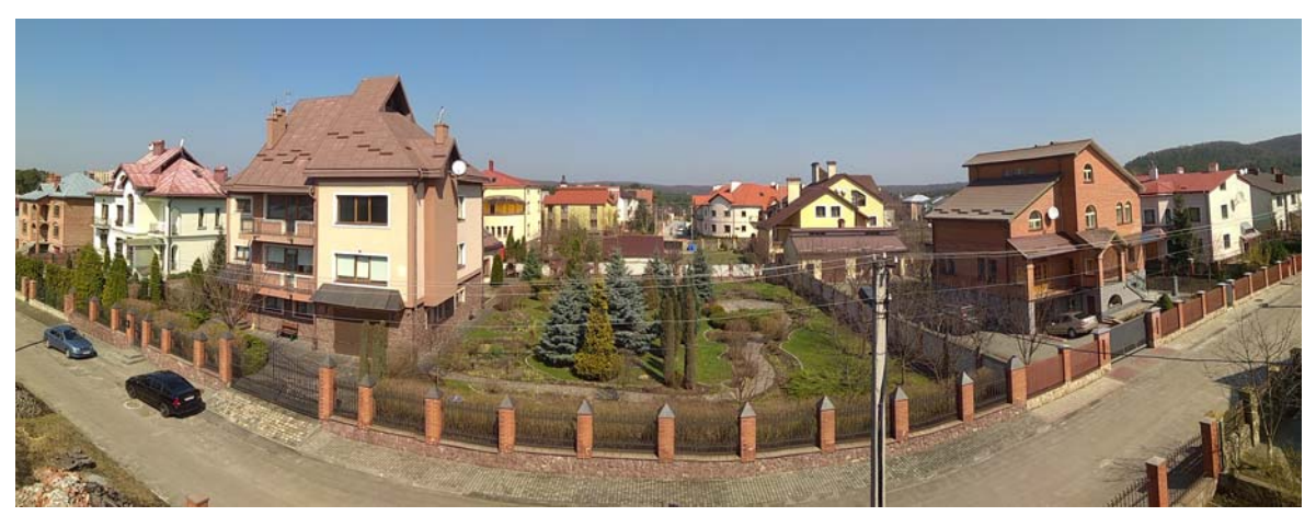
Fig. 8. Suburban houses of years 1990s, Lviv, Briukhovychi, Svitla str. (Photo by author, 2018) Ryc. 8. Domy podmiejskie z lat 1990., Lwów, Brzuchowice, ul. Svitla (Zdjęcie autora, 2018)