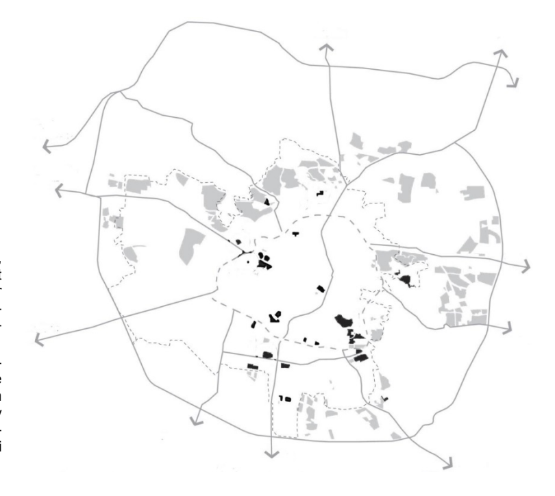
Fig. 5. Scheme of Lviv with areas, selected for housing development according to Masterplan of year 2008. Industrial areas are indicated with black.

Ryc. 5. Schemat Lwowa z obszarami wybranymi pod zabudowę mieszkaniową zgodnie z Planem Generalnym z 2008 roku. Obszary przemysłowe oznaczone są kolorem czarnym.