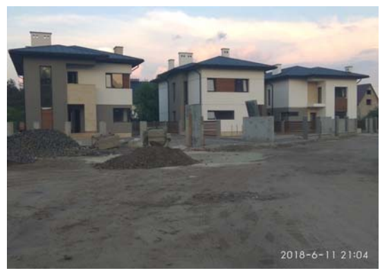
Fig. 9. New appearance of suburban houses, Lviv, Briukhovychi Ryc. 9. Nowy wygląd domów podmiejskich, Lwów, Briukhovychi