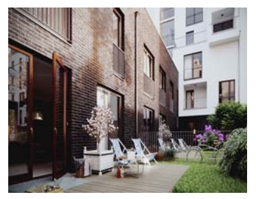
Fig. 7. Housing estate "Villa Magnolia", Lviv, Pasichna str. 160.