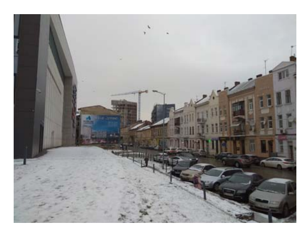
Fig. 4. Modernization process of the area between Kulisha-Pid Dubom-Dzerel'na streets in Lviv (Author, 2018). Ryc. 4. Proces modernizacji obszaru między ulicami Kulisha-Pod Dębem-Żródlana we Lwowie (Autor, 2018).