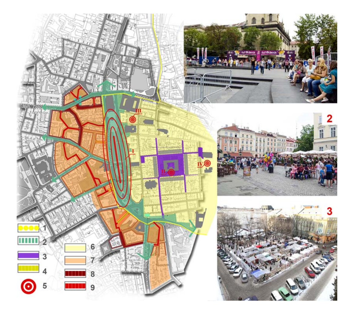
Figure 1. The model of compositional and planning reorganization and pedestrian connections development in the structure of historically formed center of Lviv. Authors: T. Mazur, E. Korol

(tourism, cognitive, museum and exhibition), spiritual and educational functions, which presupposes the preservation and restoration of monuments of historical and cultural heritage, reducing the saturation of public service institutions, which are expedient to move to the territory of adjoining historic districts, expansion of the pedestrian streets network within it and their complex improvement.