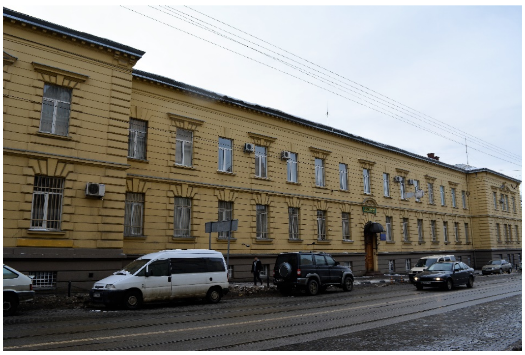
Fig. 9. Military barracks (74 Lychakivska St.).

Administrative management in Lviv was supported and effected by a great number of military men. In the 19<sup>th</sup> century the city was a big military post. Austrian government paid significant attention to construction of military objects in Lviv. An important element of urban development in the 2<sup>nd</sup> part of the 19th century was construction of barracks, maneges, shooting ranges, control stations and other military objects.