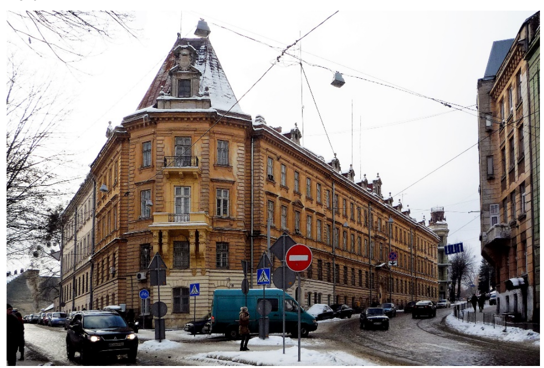
Fig. 5. Police department building and gendarmerie barracks. 1 S. Bandery St.), architect J. K. Janowski, 1890.

the building here. The second storey window above the portal is highlighted by two pilasters with two lonic order flutings. The third storey window is also accentuated with stucco décor. The central axis of façade is topped with a skylight complete with a triangular pediment.